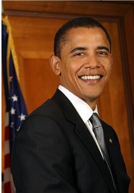
Photo of Obama accessible at http://en.wikipedia.org/wiki/Barack_Obama

Disabled People were explicitly included in the acceptance speech of the new President elect. Barack Obama stated that America is a place where all things are possible.