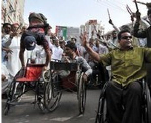
Photo: Disabled people and supporters of the ruling Pakistan People's Party (PPP) dance to celebrate the swearing-in of the party's co-chairman Asif Ali Zardari as the country's new president in Karachi (in September 2008).